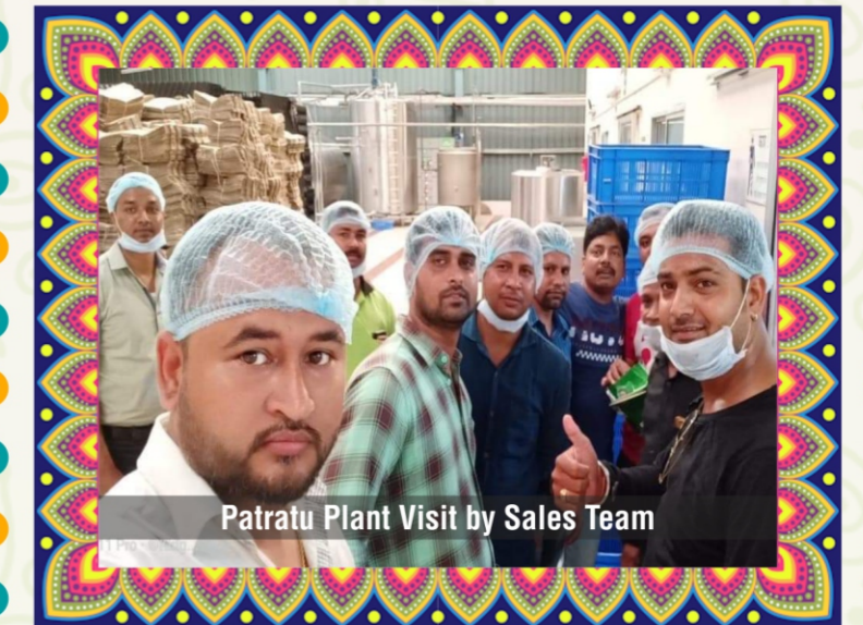
Patratu Plant Visit by Sales Team