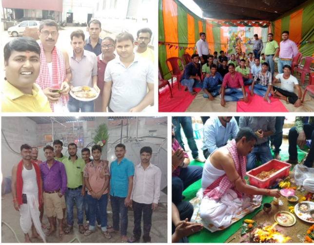
Vishwakarma Puja and Celebration at Patratu, Chandil & Begusarai plant.