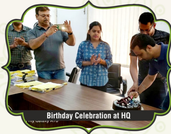
Birthday Celebration at HQ