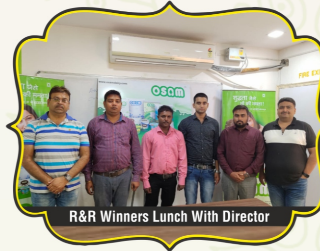
R&R Winners Lunch With Director